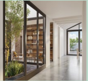
For more information, visit www.krakowconstructions.com.au

A Hamptons style home and land package from Krakow Constructions is now selling in Bingara Gorge's Fairways North precinct (Lot 367). Lot size 699m<sup>2</sup> and home size 363.9m<sup>2</sup>.